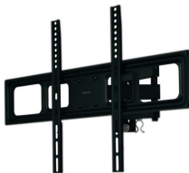
ARTICULATING WALL BRACKET