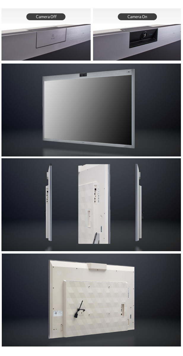
* All images in this datasheet are for illustrative purposes only.