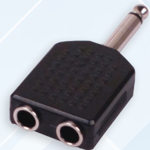
Nurse Call Y Adapter