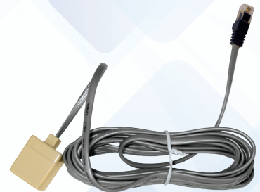
10' Extension Cord