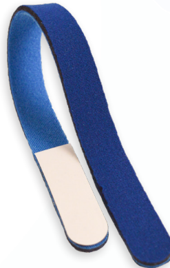
Velcro Strap & Strip