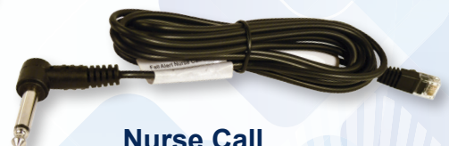
Nurse Call Connection Cord