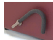
EZ Reach Handle