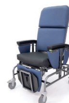
Optimum Posturo-Pedic Positioning Chair