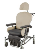
Comp-Position Positioning Chair