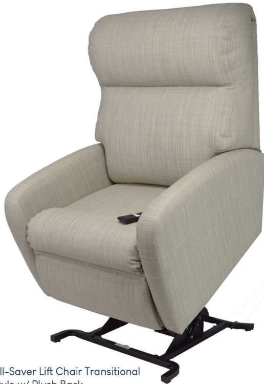
L-1012-ZS Wall-Saver Lift Chair Transitional Style w/ Plush Back Healthcare Vinyl