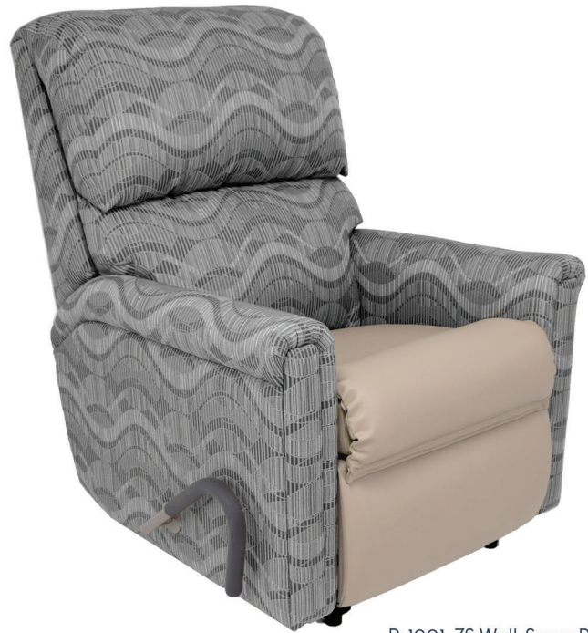
R-1001-ZS Wall-Saver Recliner 2 Pillow Back w/ EZ Reach Handle Crypton & Naugasoft