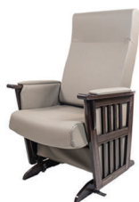
Wood Thera-Glide Contemporary Style