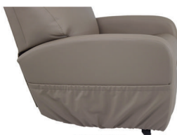
Side Pocket available for right, left or both sides