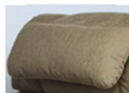
Cervical Head Rest