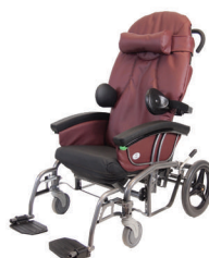
Dyn-Ergo Scoot Chair