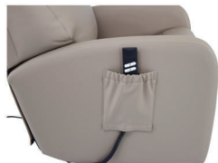
Hand Control Holster