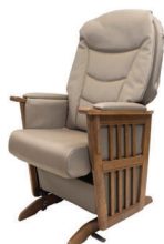
Wood Thera-Glide Traditional Mission Style