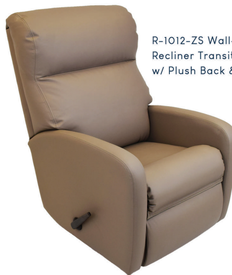
R-1012-ZS Wall-Saver Manual Recliner Transitional Style w/ Plush Back & Standard Handle

Manual Recliner available in 3 different Ottoman Spring Tensions: Light, Medium, Firm