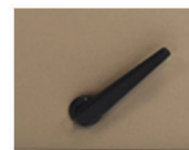
Standard Recliner Handle