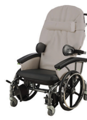
Evolution Mobility Chair