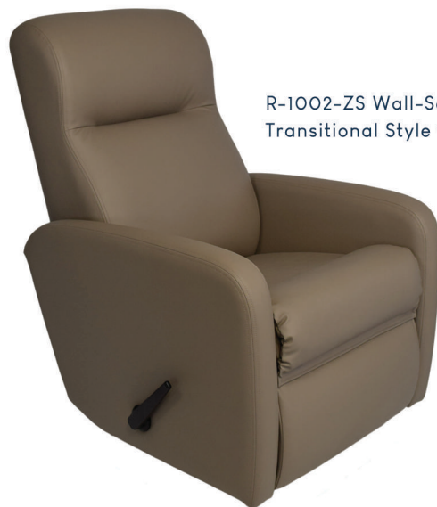
R-1002-ZS Wall-Saver Manual Recliner Transitional Style w/ Standard Handle

Manual Recliner available in 3 different Ottoman Spring Tensions: Light, Medium, Firm