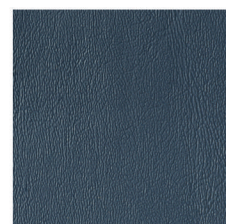
Naugasoft Sapphire Blue