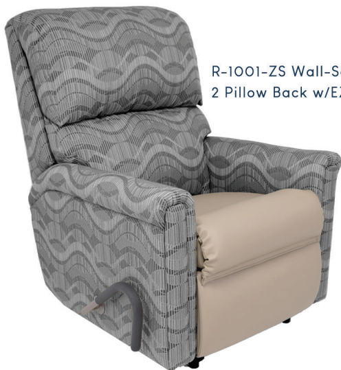
R-1001-ZS Wall-Saver Manual Recliner 2 Pillow Back w/EZ Reach Handle

Range of Styles & Sizes - Available in Transitional, Transitional w/ Plush Back, Petite, Standard, Wide and X Wide.