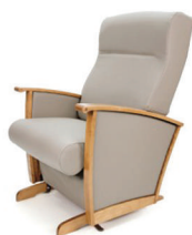
Transitional Style Thera-Glide Safety Glider