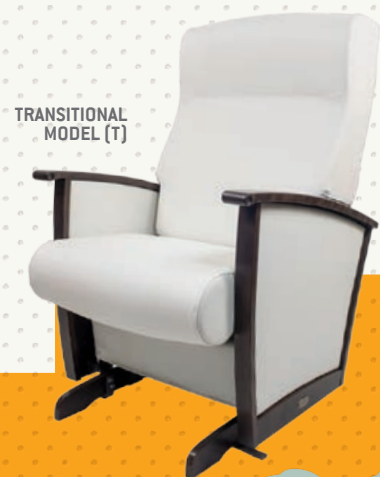
TRANSITIONAL MODEL (T)