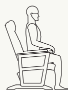
Secure when sitting down

The Thera-Glide® glider has a place for itself in the healthcare world, both for its therapeutic effects and for its incredible functional and safety features. Its patented automatic immobilization mechanism keeps the chair fixed when getting up and allows rocking when the person is fully seated. The system is easy, quiet and locks in any position. Depending on the model, its adjustment options and accessories, you can adapt the Thera-Glide® to meet your specific needs. It is easy to maintain thanks to the removable upholstery and the materials used in its design.