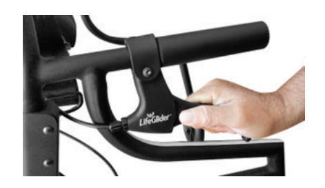
To lock the rear wheels in place, push down on the lever until you hear a click.