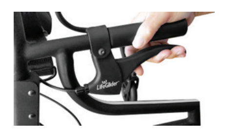
To apply the brake, squeeze the lever.

When your feet are planted firmly on the ground, the LifeGlider won't go anywhere. However, there will be times when you may want to use the braking system. We recommend always locking the brake when getting in and out of the LifeGlider. When applied, the brake will lock the rear wheels and stop the LifeGlider from moving. It's important to note that if you walk with the brakes applied, the LifeGlider's wheels will slide rather than roll.