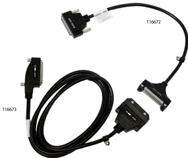
MAGNETIC BREAKAWAY "PIGTAIL" SOLUTION