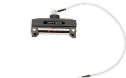
MAGNETIC DUMMY PLUG 116110