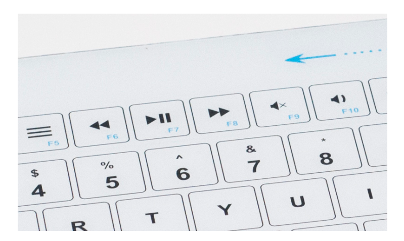
Full Video Playback Controls