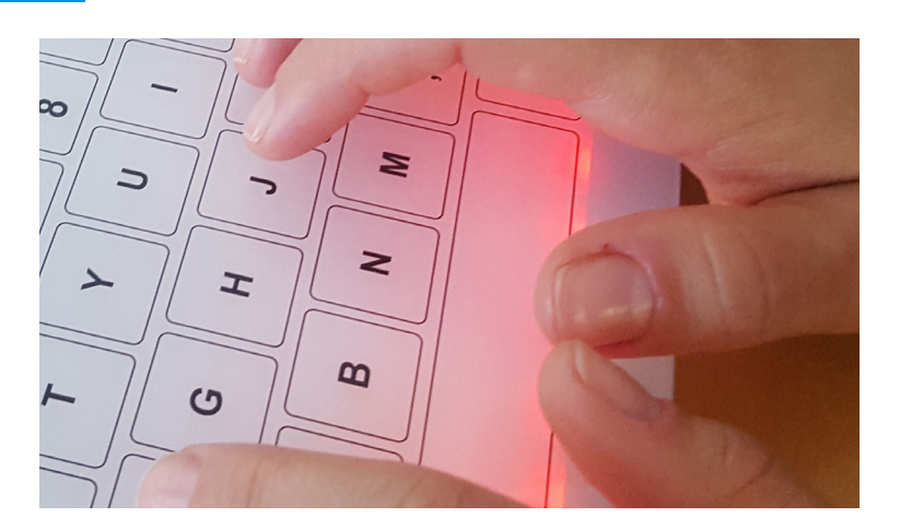
LED "Do Not Disturb" mode