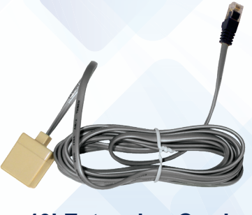
10' Extension Cord