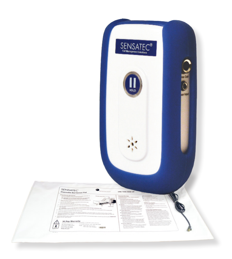
Fall Management Solutions