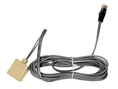
10' Extension Cord