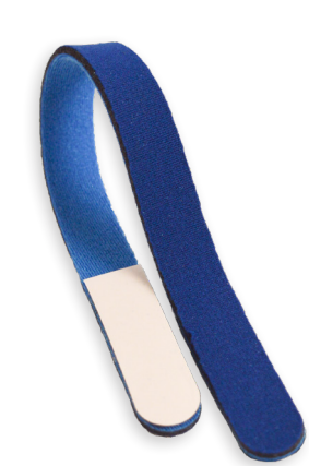
Velcro Strap & Strip