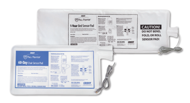
Crest Fall Fighter® Universal Sensor Pads for beds and chairs

Contact Crest Customer Service at 1-800-328-8908 to get started with your order today!