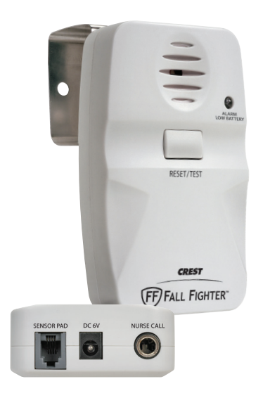
Crest Fall Fighter® Monitor

Contact our Customer Service Team or view our online catalog to learn more about Fall Fighter and the full range of products available.