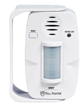
Crest Fall Fighter® Infrared Monitor providing motion detection