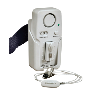
Crest Fall Fighter® String Monitor offering a mobile solution