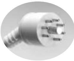
8 pin plug

With strain relief for Curbell Gen I & II Pillow Speakers