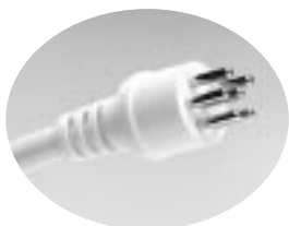
6 pin plug

With strain relief for Curbell Gen I & II Pillow Speakers