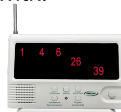
Central Monitor Unit 433-CMU-40/60