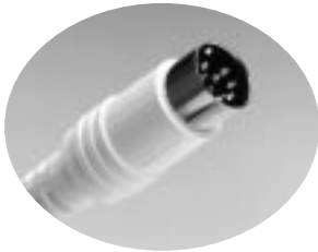
8 pin DIN plug

With strain relief for Curbell Gen I & II Pillow Speakers