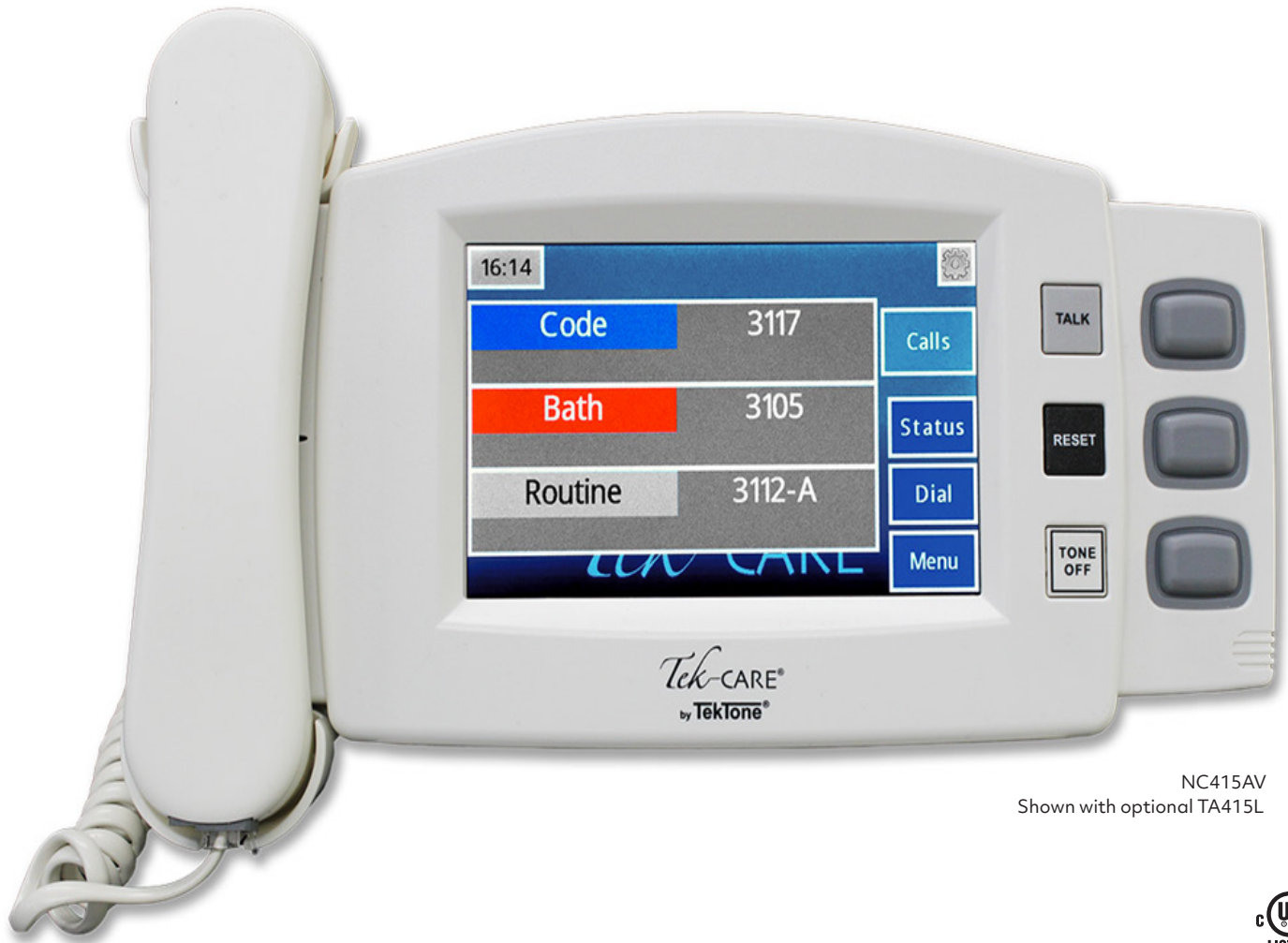
NC415AV Shown with optional TA415L