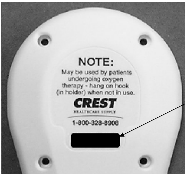
Write part number in this recessed area with a permanent marker