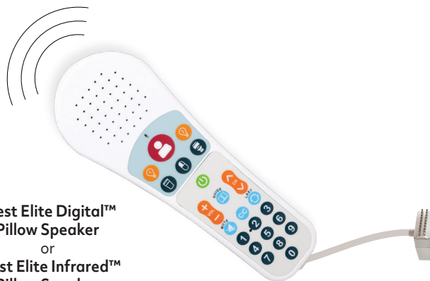
Crest Elite Digital™ Pillow Speaker or Crest Elite Infrared™ Pillow Speaker